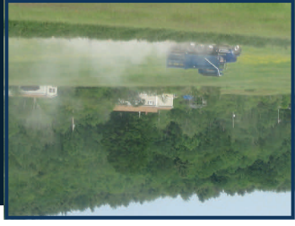
Dust is a nuisance for neighbors as well as a health concern.

Keep a clean pit. Solid waste and demolition debris may not be disposed of or burned in a pit. Use water or calcium chloride to reduce dust from truck traffic. Be proactive in solving problems, and maintain good relations with your community.