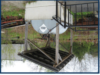
Store all petroleum products, including drums and buckets, in a covered secondary containment structure.

Handle petroleum products with care. Keep a spill kit on-site. Report all spills, no matter the size, to the DEP Spill Hotline at 800-482-0777.