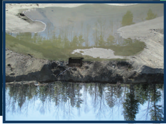
Standing water is a sign that your pit floor is too close to groundwater.

The bottom of the pit floor must be at least 5 feet above the seasonal high groundwater table. This can be verified by installing monitoring wells or digging a test pit.