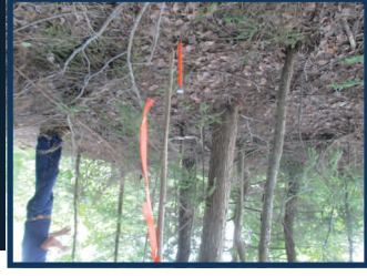
Flagging your property lines and buffers will help keep you in compliance.