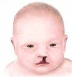
Baby with cleft lip