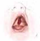
Baby with cleft palate